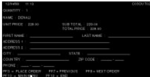
Web390 offers 3270 green-screen emulation...