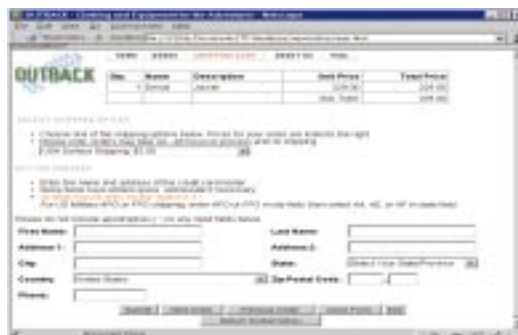
HTML/TP allows you to customize the HTML screens Web390 translates for the Web.