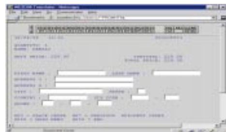
...or automatic translation of 3270 screens into HTML.